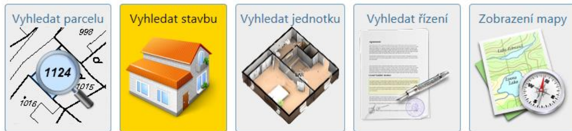
Fig.1 Graphical menu for information about parcels, buildings, flats, cadastral procedures and cadastral map