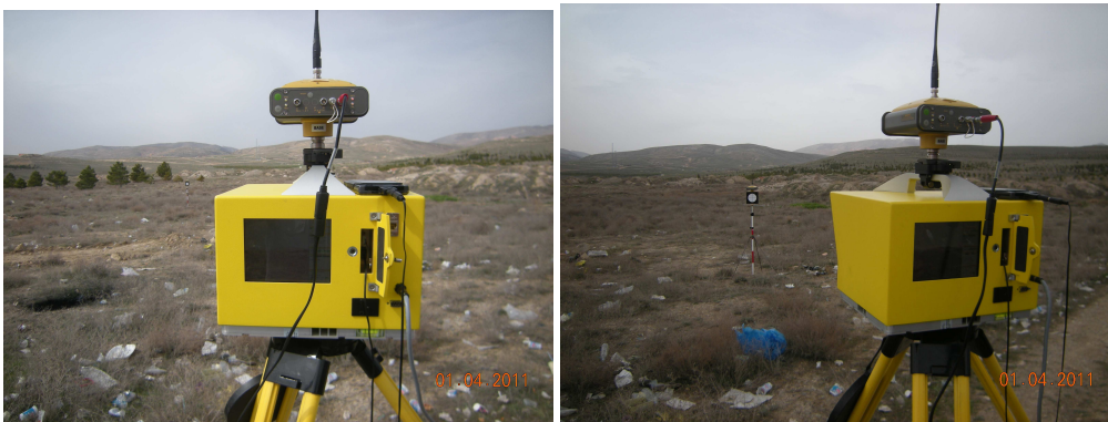
Figure 1. TLS-GPS sensor combination

Where; [X_o, Y_o, Z_o]^T and R_{\omega\phi\kappa} are translations and rotations respectively between GPS and TLS coordinate systems, and \lambda is scale. [X \ Y \ Z]^T_{GPS\text{receiver}} is GPS coordinate of the GPS receiver on the TLS, and [t_x \ t_y \ t_z]^T is translations between TLS and GPS receiver.