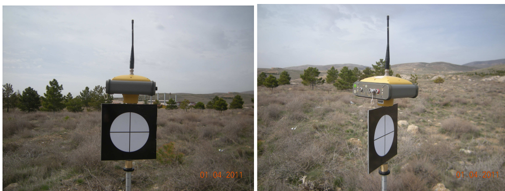
Figure 2. GPS receiver and target shape combination