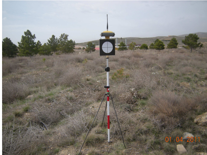
Figure 3. GPS receiver and target shape combination on scan field