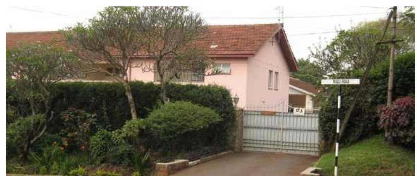
An old Bungalow in Upper Hill Nairobi

A broad overview of Upper Hill now reveals its resplendence with neat organized rows of high rise buildings which have come up recently and which belong to blue chip local and multinational companies. It has become a favorite location for multi-nationals, regional and local companies such as Standard Chartered Bank, Equity Bank, the World Bank, the Cocacola, Commercial Bank of Africa and the Pricewater Coopers who find the population of East Africa at more than 200 million sufficient for their operations whose threshold is a population of 140 million. This trend has led to the increase in the demand of office space and residential spaces. These dynamics and others have seen Upperhill rapidly transform into a prime office location in Nairobi. Modern apartments and residential maisonettes confined in gated communities have also taken place. Although a lot of business companies have relocated to the area, the main challenge remains that as a recent commercial hub, whose growth took place largely in the past two decades the available services may not be commensurate with the growth that has been taking place in Upperhill.