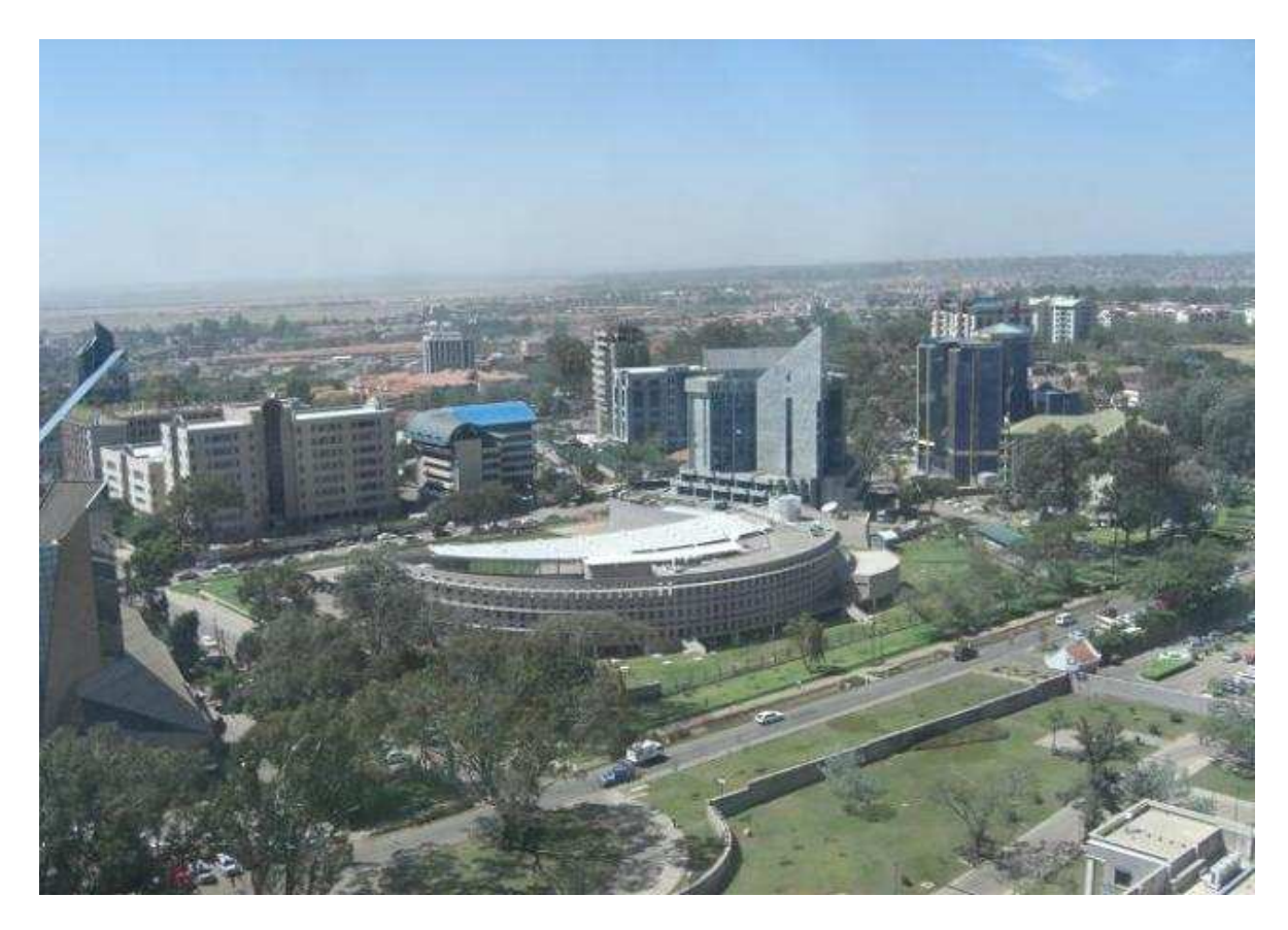
Panoramic view of Upper Hill Nairobi