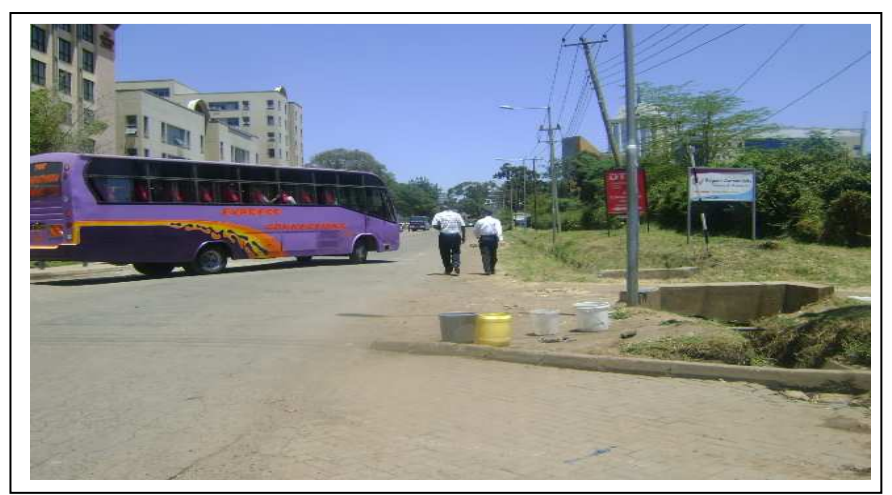
Public transportation means and roads in Upper Hill

Public transport is available in the area within reach of users as public transportation is available throughout. However, the expansion of the roads must be in tandem with the developments taking place in Upperhill. There is need for road infrastructure expansion in Upperhill to cater for the new use. However this will be difficult unless the government acquires land for expansion compulsorily as most of the roads are narrow residential roads.