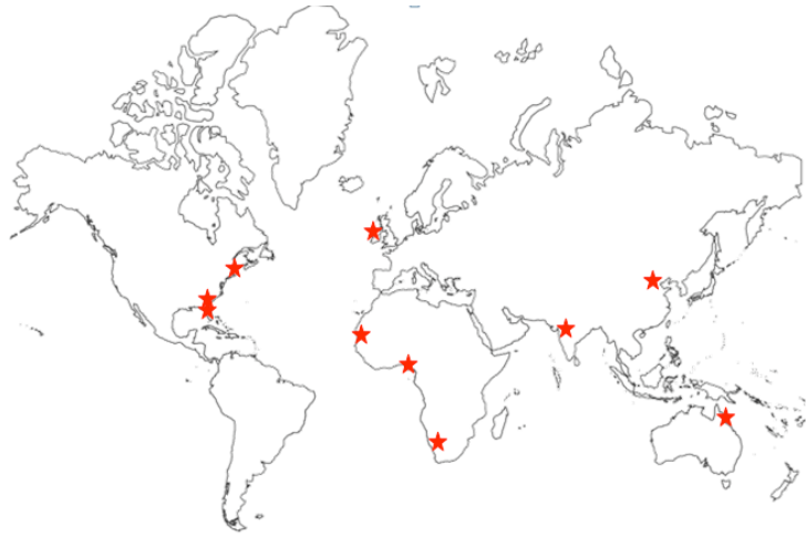
Figure 1. Global Network of MDP Programs