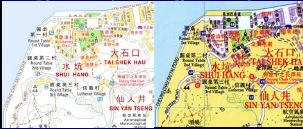
B10000 Data of Lands Department