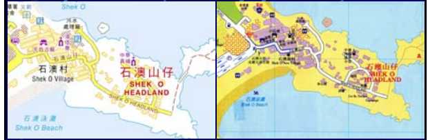
B10000 Data of Lands Department