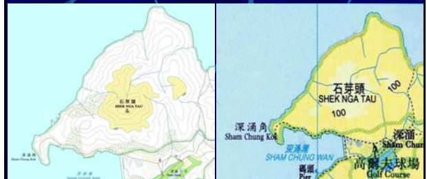
B10000 Data of Lands Department