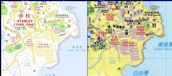
B10000 Data of Lands Department