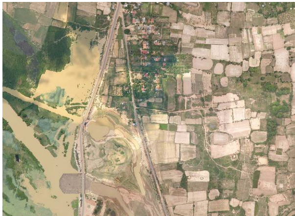
Fig 8: Infrastructure project (Seang 2005)

Digital geo-referenced images of Battambang town (NW Cambodia) were already produced for the district department of urban planning and construction. In 2004 and 2006 aerial balloon surveys were flown on different scales of 40cm and 10 cm ground resolution for urban master plan purposes, for regional development as well as change detection in the urban environment with regards to housing and infrastructure measures for informal settlements in the urban areas. For a second project, pictures of a scale of 1: 10.000–1:15.000 were taken in in remote rural areas with degraded open forest vegetation in NW Kampong Speu province. The topic is a seasonal to 5 years change detection observation of a degraded open forest environment for a special observation site of forest re-growth and vegetation recovering. Further images were taken for simple area observation and base maps of two national universities in Cambodia (Royal University of Agriculture and Preah Leap National School of Agriculture) in the surrounding of Phnom Penh. But one of the most advantageous applications of this method is the production of base maps for medium scale infrastructure projects like bridge and road construction, hydraulic engineering and irrigation projects in the Cambodian lowlands.