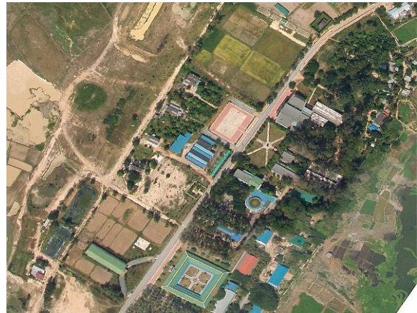
Fig 9: Detailed University picture