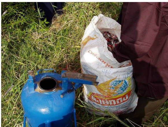
Fig 1: Hydrogen production

The utilized balloon is made of light PE material with a maximum size of inflation of about 2.5m. It is fixed and controlled via 6-8 non flexible offshore fishing lines adjusted at special fixation tongues on the bottom of the balloon. As inflation gas helium or hydrogen can be used. While helium is still very expensive and problematical to acquire in developing countries, hydrogen was chosen for this application in Cambodia. The advantage of hydrogen is its uncomplicated production on the test site based on aluminum cans, water and a special salt which are easy to transport and assembly just beforehand its application. The critical danger of hydrogen is its chemical unstable reaction prone to dangerous explosion and inflammation. The chemical reaction formula with the resulting hydrogen gas and Natriumaluminiumat is given as follows: 2\text{Al} + 2\text{NaOH} + 6\text{H}_2\text{O} = 2\text{Na}[\text{Al}(\text{OH})_4] + 3\text{H}_2 .