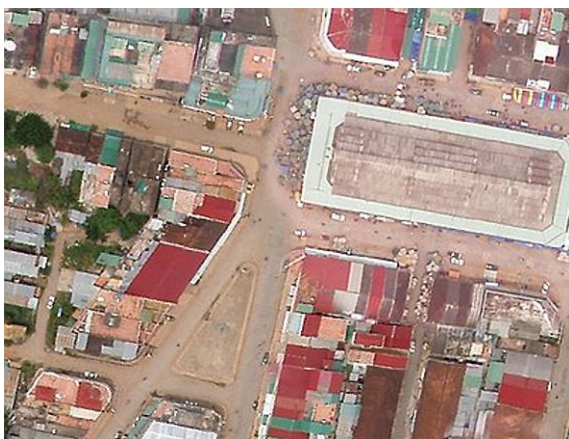
Fig 6: Market Area I Battambang in 1:1.000