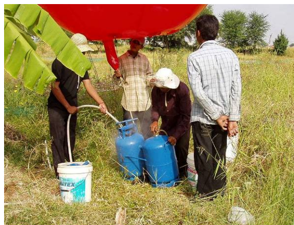
Fig 2: Balloon filling with Hydrogen Gas