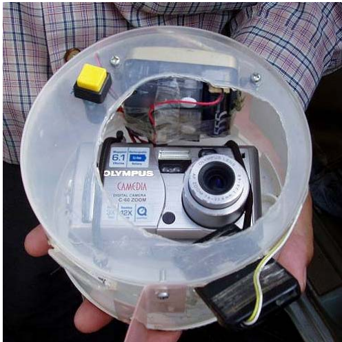
Fig 3: Camera and GPS holder

A non calibrated simple 7 Megapixel digital camera (Olympus C70) is fixed in a light plastic holder together with the infrared remote control and a GPS receiver. The camera is activated by a special electronic clock and is set to take pictures every 10 seconds synchronized with a GPS receiver. Resulting pictures will have a ground resolution below 1m up to 5-10cm. Balloon levels of 50 to 400m above ground with different resulting ground resolution are possible with decreasing positioning accuracy of picture nadir points in higher altitudes. The price of the complete photo acquisition bundle add together around 2500 $ including camera and GPS receiver. Problematic are the balloon sensitivity to wind speed over 3m/sec and explosive inflation gas.