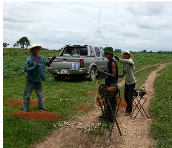
Fig 4: Balloon fixation and control