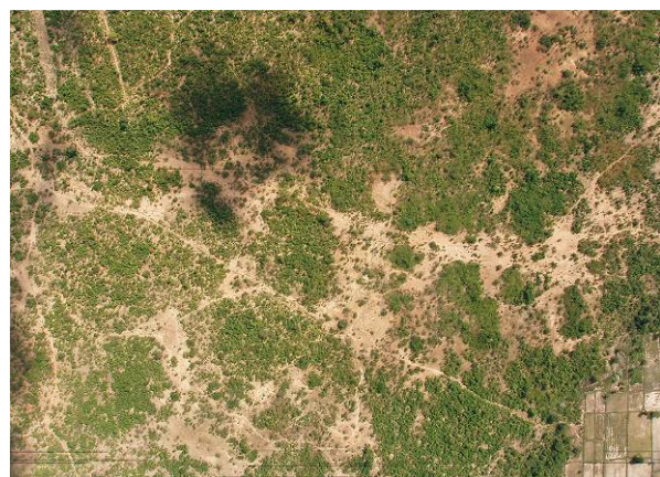
Fig 7: Degraded open forest area 1:5.000