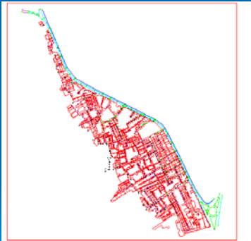
Figure (2.1) Case study area