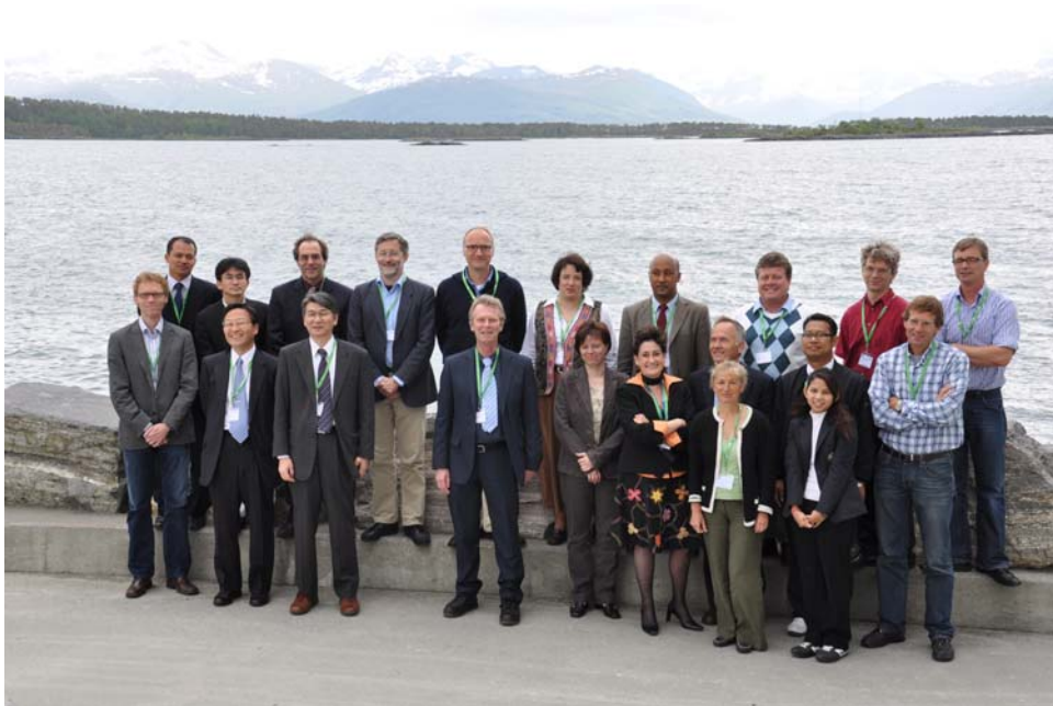
Figure 3. ISO 19152 Editorial Committee, Meeting in Molde, Norway, May 2009

During the development of the LADM many reviews have been performed resulting in new insights, improvements and proposals for extensions.