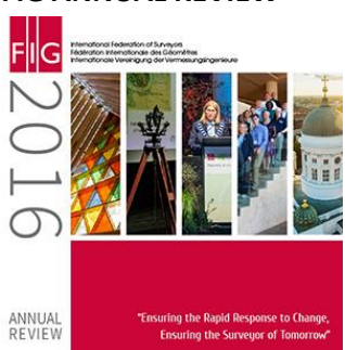
FIG ANNUAL REVIEW

2016 was an exciting and busy year for FIG. The Annual Review highlights some of the activities and achievements throughout the year. www.fig.net/news/news 2017/05 annual review.asp