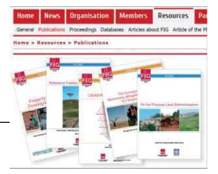
FIG e-Newsletter September 2016

Formalizing the Informal: Challenges and Opportunities of Informal Settlements in South-East Europe. Reprint: