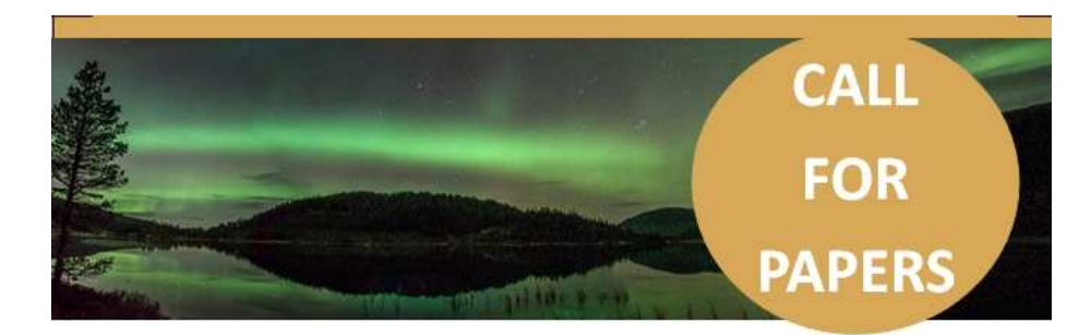
FIG Working Week 2017 – Helsinki, Finland