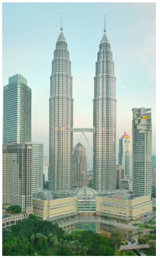
The impressive Petronas Twin Towers in Kuala Lumpur, Malaysia.