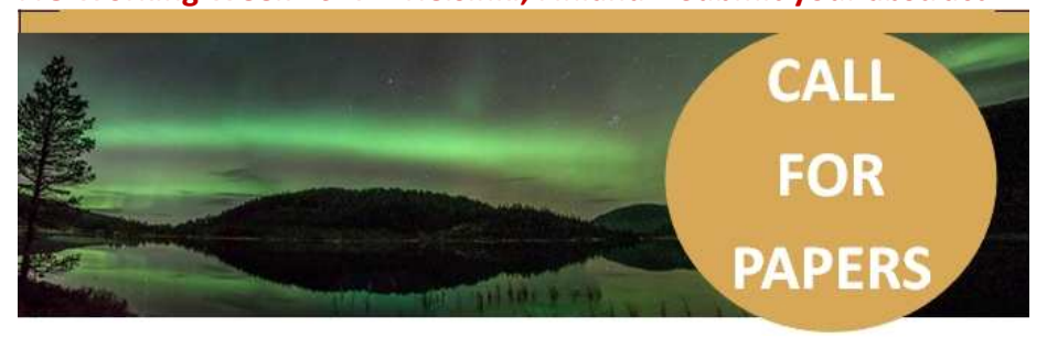
FIG Working Week 2017 will take place in Helsinki, Finland 29 May – 2 June 2017 at Messukeskus Expo and Convention Centre