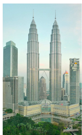
The impressive Petronas Twin Towers in Kuala Lumpur, Malaysia.