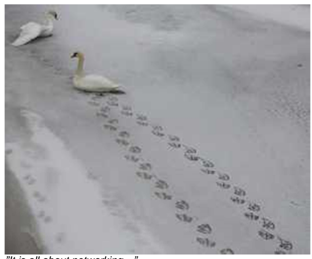
"It is all about networking..."

Welcome to the FIG Newsletter, which brings you latest information about FIG and its activities. The information referred here is in full length available on the FIG web site. Thus the Newsletter is produced to inform you what has happened recently and what interesting things are going to take place in the near future. The FIG Newsletter is circulated monthly or bi-monthly by e-mail. The referred articles are in English and written in a way that you are able to extract them to your national newsletters or circulate to your members and networks.