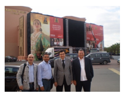
Meetings of the organising committee in Marrakech