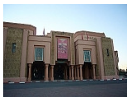
Palais des Congres, Marrakech

The main issues on the General Assembly agenda in 2011 will be adoption of the Council and Commission work plans. These will be our roadmap over the next four years. As there will be no election at this year's General Assembly, there will be more time available for discussions. The Council will organize a break-out session focusing particularly on issues related to the rights and obligations of membership (voting rights). The General Assembly Agenda has been sent to all members of FIG. Please also find the agenda here: