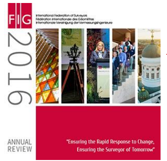
FIG ANNUAL REVIEW

2016 was an exciting and busy year for FIG. The Annual Review highlights some of the activities and achievements throughout the year. www.fig.net/news/news_2017/05_annual_review.asp