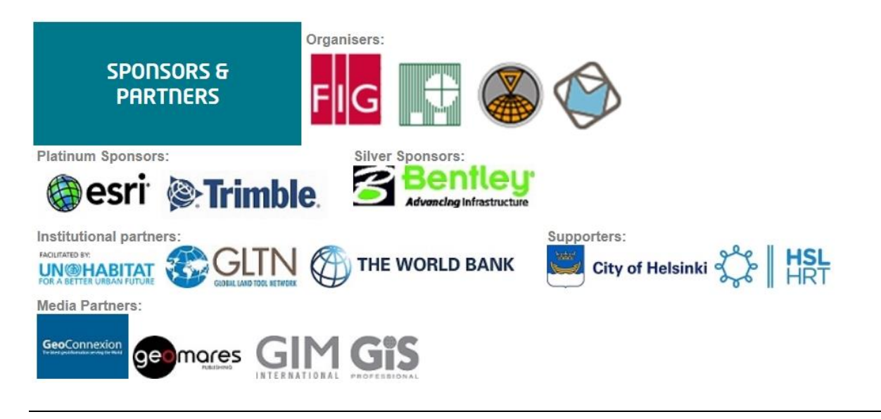
FIG Congress 2018 – Call for Papers