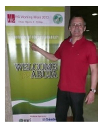
FIG 36th General Assembly 2013 welcomed two New Member Associations 6 and 10 May 2013, Abuja, Nigeria – report and minutes

www.fig.net/pub/fig2012/papers/opening/opening_teo.pdf Working Week Summary presentation: www.fig.net/admin/ga/2013/minutes/app_26_ga_summary.pdf