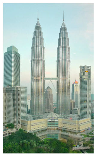
The impressive Petronas Twin Towers in Kuala Lumpur, Malaysia.

Do not miss FIG Congress 2014 which will be a most spectacular event. At the General Assembly there will be voting for the new President of FIG, two new Vice Presidents, the venues both for the 2017 Working Week and 2018 Congress. The Congress will also offer an interesting four-day technical program including plenary sessions, special forums and seminars as well as technical sessions. The call for paper and opening of the submission of abstracts will follow soon. There will be the possibility to submit papers for peer review.