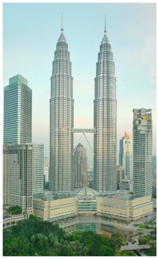
The impressive Petronas Twin Towers in Kuala Lumpur, Malaysia.