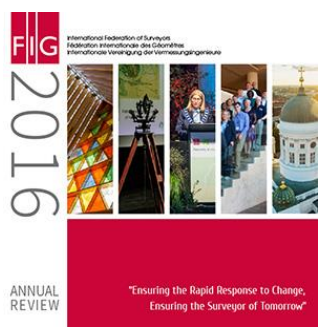
FIG ANNUAL REVIEW

2016 was an exciting and busy year for FIG. The Annual Review highlights some of the activities and achievements throughout the year.