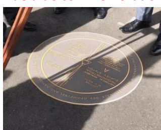
FIG International Institution for the History of Surveying and Measurement, IIHS&M, has been helpful in the process of commemorating the irst trigonometric allotment in coordinated system. IIHSΜ has been working on this since the FIG Congress 2010 in Sydney, Australia

http://www.fig.net/news/news_2017/05_adelaide.asp