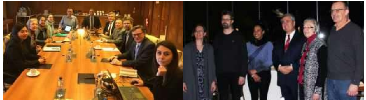
Local Organising Committee from the Chamber of Surveying and Cadastre Engineers of Turkey and FIG Council working on the preparations for the FIG Congress 2018