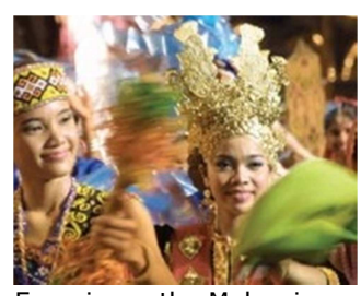
Experience the Malaysian culture at the congress

social functions, giving you a unique opportunity to discuss best practices within the surveying profession with follow peers. The Kuala Lumpur 2014 FIG Congress should be of interest to participants from all over the world and will be a memorable experience not to be missed.