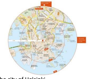
The city of Helsinki

On Sunday 28 May conference days you have the opportunity to choose between three different pre-events: