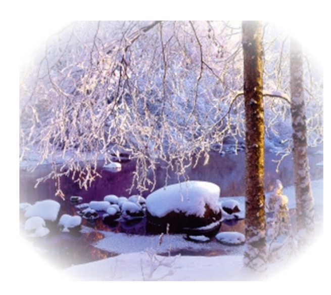
FIG Office wishes you:

Welcome to the FIG e-Newsletter, which brings you latest information about FIG and its activities. The information referred here is in full length available on the FIG web site. Thus the e-Newsletter is produced to inform you what has happened recently and what interesting things are going to take place in the near future. The FIG e-Newsletter is circulated monthly or bi-monthly by e-mail. The referred articles are in English and written in a way that you are able to extract them to your national newsletters or circulate to your members and networks.