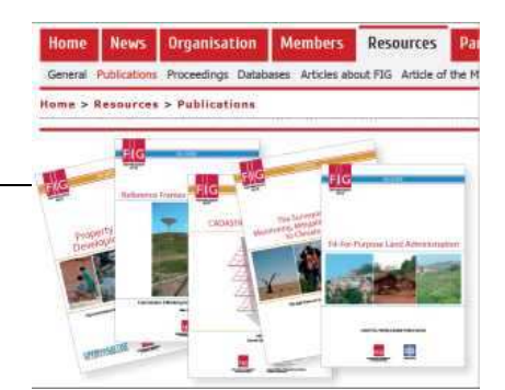
FIG e-Newsletter August 2016