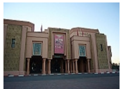
Palais des Congres, Marrakech

The main issues on the General Assembly agenda in 2011 will be adoption of the Council and Commission work plans. These will be our roadmap over the next four years. As there will be no election at this year's General Assembly, there will be more time available for discussions. The Council will organize a break-out session focusing particularly on issues related to the rights and obligations of membership (voting rights). The General Assembly Agenda has been sent to all members of FIG. Please also find the agenda here: