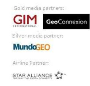
FIG Annual Review 2015