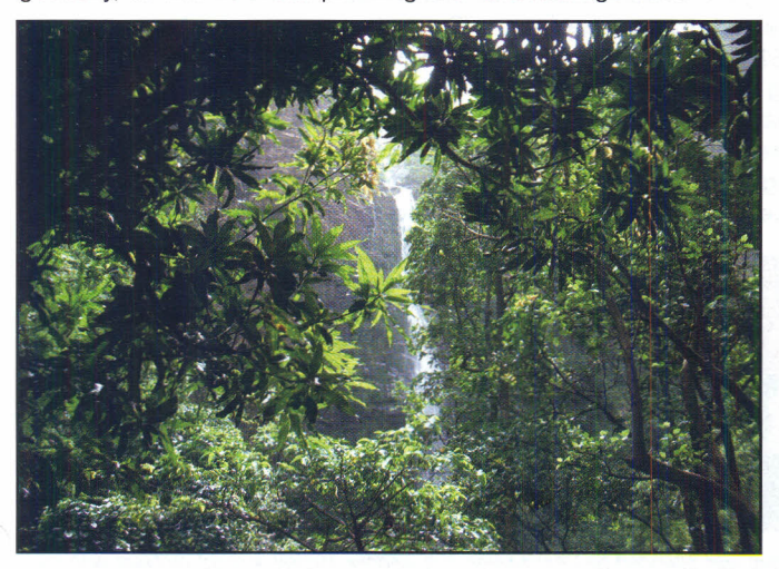
The Wli waterfall in the Agumatsa Forest Reserve in the western region of Volta.

Working group 8.4 (disaster risk management) defines the contribution of the surveying profession to disaster risk management. This geodetic applications in geodetic engineering, photogrammetry and remote sensing, GIS, satellite geodesy, as well as urban planning and land management.