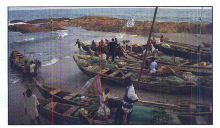
Fishing boats in Cape Coast.

There has been continuous improvement and enlargement of the working group's website (www.isbk.uni-bonn.de/fig) and research project activity includes four papers integrating four themes; megacities, tools for prevention, valuation and risk management strategies for planning.