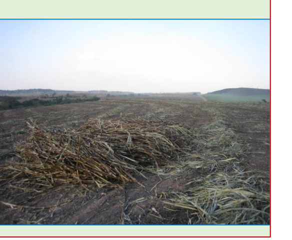
Uchendu Eugene Chigbu, FIG Comm-8 & TU Munich