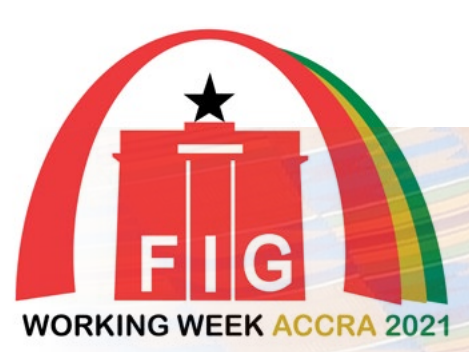
FIG Working Week 2021 Accra, Ghana