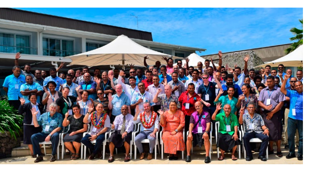
The FIG Asia Pacific Capacity Development Network (AP CDN) together with Commission 5 convened a Reference Frame in Practice Seminar held in Fiji with almost 100 participants from 14 countries in the region.