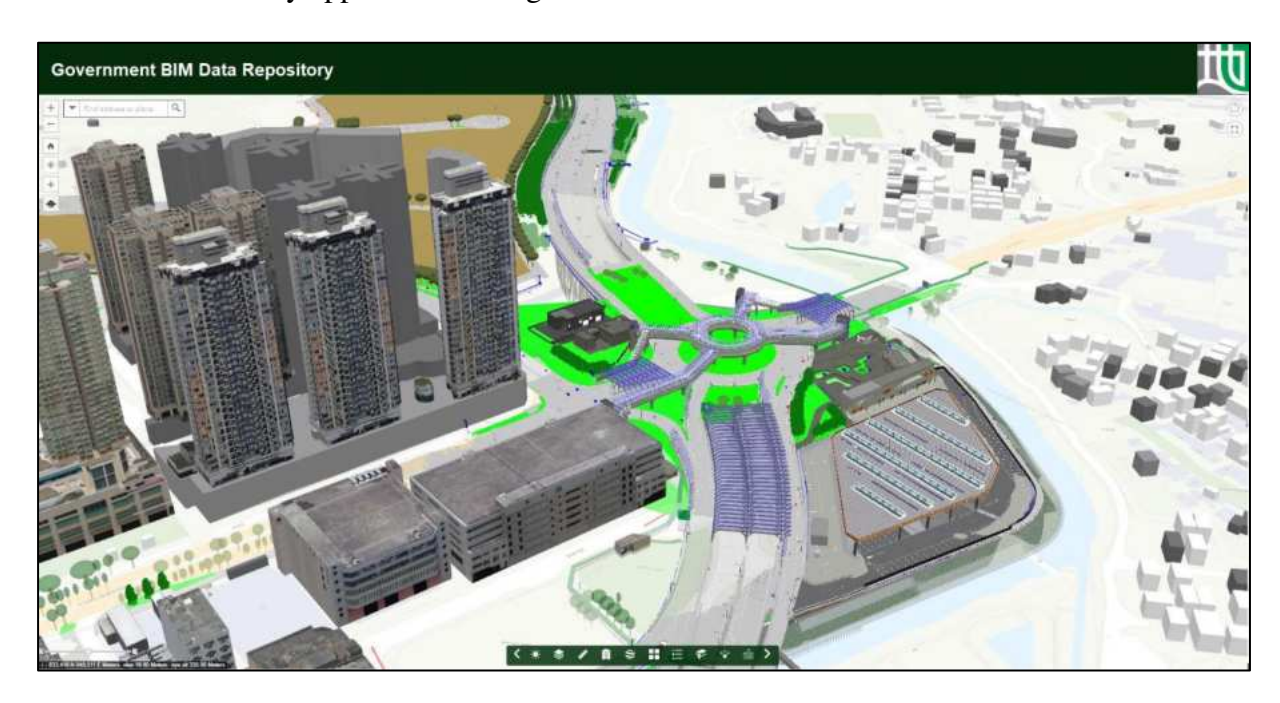
Figure 1 3D visualization platform of the GBDR

BIM harmonisation, the development of new functions for BIM data visualization, spatial query and analysis, and the provision of BIM Application Programming Interfaces (APIs) to simply system integration by developing interfacing of departmental common data environments (CDEs) with the GBDR. These ongoing improvements and features cater to the increasing needs of the government departments in terms of BIM data sharing, visualization, and support for further smart city applications using the GBDR as a service.