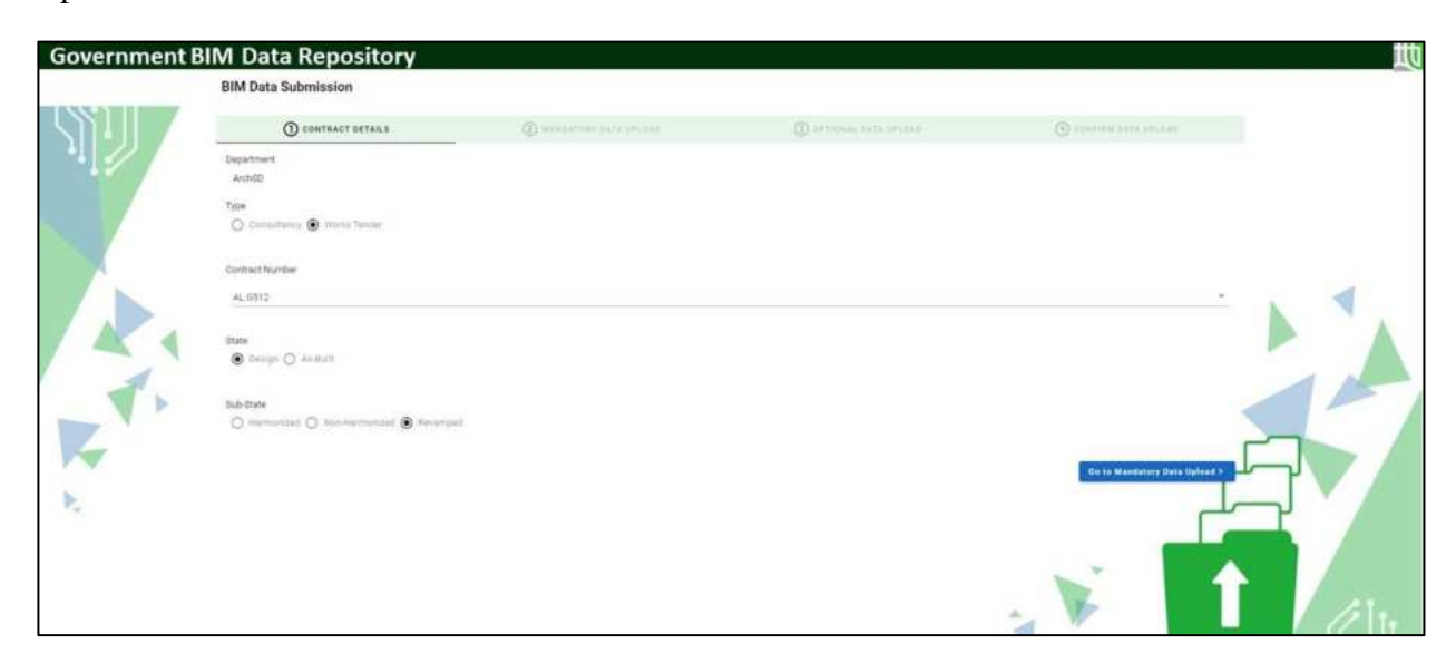
Figure 2 Web-based user interface for submitting BIM data to the GBDR

To support the semi-decentralized BIM data submission approach, a new web-based user interface (UI) for BIM data submission (refer to Figure 2) has been developed and implemented on the GBDR. The UI incorporates a set of rules for intelligent BIM submission completeness checks. Users can validate the completeness of their BIM submission before proceeding to the next step, ensuring that all the required information is submitted. Consequently, the completeness of BIM data submission on the GBDR has significantly improved. The combination of centralized and semi-decentralized approaches for submitting BIM data provides a more efficient and user-friendly BIM data submission workflow to governent departments.