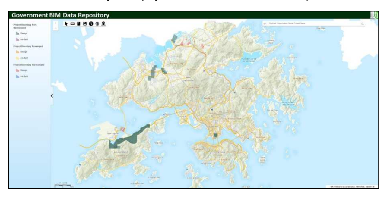
Figure 5 Display of project boundaries on the 2D map web interface of the GBDR

To enhance the searching function of the GBDR, the system has been enhanced to incorporate the Geographical Searching function. As part of the submission process, government departments are now required to include a project boundary file along with their BIM submissions to the GBDR. The project boundary submitted would be used to enable visualisation of the project site extent and boundary in the 2D map web interface. As such, users who may not have knowledge of specific project names or numbers can navigate and review areas of interest on the map, identifying suitable BIM data, as illustrated in Figure 5 .