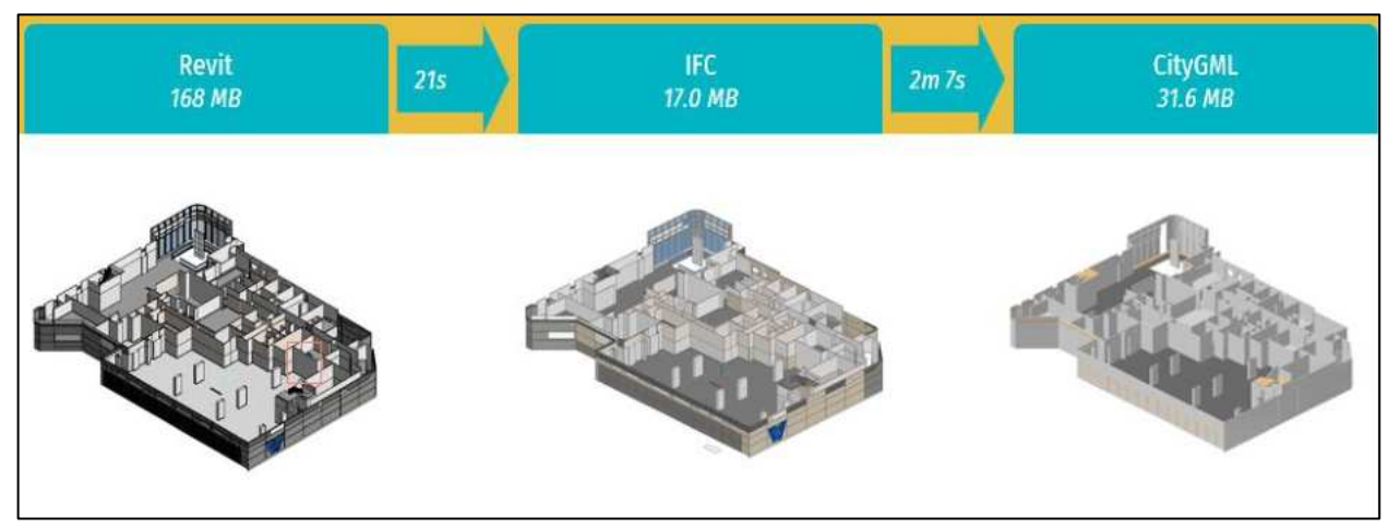
Figure 4 Conversion of a BIM data to OpenBIM and OpenGIS with simplification

Figure 4 illustrates the conversion workflow from native BIM data to IFC and CityGML. A conversion engine is embedded in the GBDR to enable the conversion of some native BIM data to IFC and CityGML formats. The development of the powerful conversion engine is a significant milestone in the history of the GBDR development because detailed configuration and mapping tables are implemented after reviewing over hundreds of BIM files to minimise data loss in the data format conversion process. Moreover, considering the limited availability of best practices for exporting meaningful and specific IFC models in the BIM industry, the Lands Department is developing step-by-step best practices for recommending users to export IFC models with appropriate configurations and settings. The promotion of IFC and CityGML enhances data interoperability in the GBDR and foster collaboration among government departments in the long run.