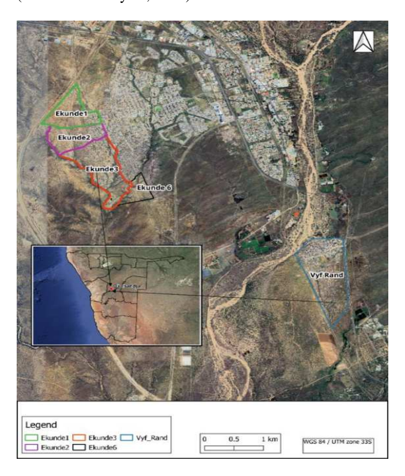
Figure 1: The selected informal settlements in Okahandja

Land Information in Informal Settlement Upgrading: the Social Tenure Domain Model as an Empowerment Tool in Okahandja, Namibia (12634)