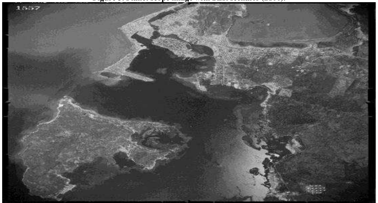
Figure 4. Cartagena Aerial Photography (1954).

Figure 3. Planet scope image with SLR scenario (2100).