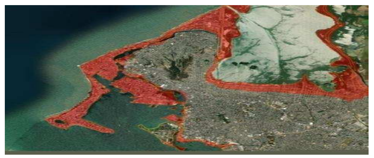
Figure 3. Planet scope image with SLR scenario (2100).

CO2 is the most studied variable to understand the climate change in the region. From the perspective of millions of years, climate changes triggered by volcanism or anoxic events can be similar to current climate change due to the modification of greenhouse gas concentrations, but with the difference of origin and speed in which it is evidenced as the cost erosion or melting of tropical glaciers, we will now look at how it can impact in the specific case of Cartagena (Bolivar) the rise in the average sea level.