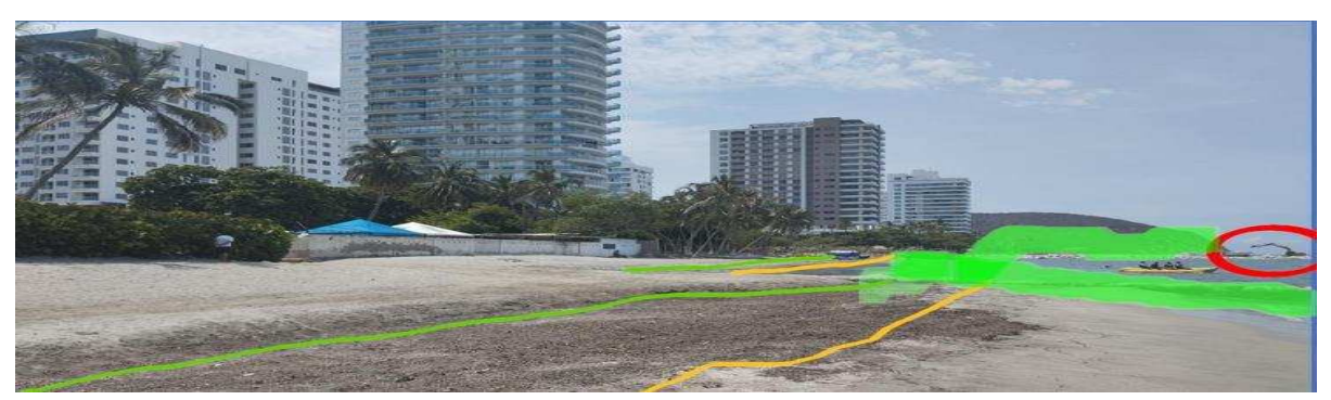
Figure 1. Diagram representing the variations of the different moments of the beach formation due to the intervention of spurs in the Salguero Beach area (2023).

The area of the Caribbean coast since before the Spanish Conquest was populated extensively, evidenced by the chronicles where observations of culture, censuses and environmental descriptions, coasts and the great mountains of the Andes or plains and jungles of the "New World" (Arciniegas, 1862) marked the first information of the first settlers, which shows a broad interaction with the territory. Currently in the 40 municipalities of the Caribbean coast there are more than four million people according to DANE in the 2018 census, where the majority of the population is located in its three main cities of Barranquilla, Cartagena de Indias and Santa Marta. In the coastal areas there are also different zones of strategic importance for agricultural production and environmental conservation, as well as most of the densely populated areas that generate high demand for resources and critical cases of socioenvironmental conflicts, especially in the areas of the swamps and the coal ports in Santa Marta.