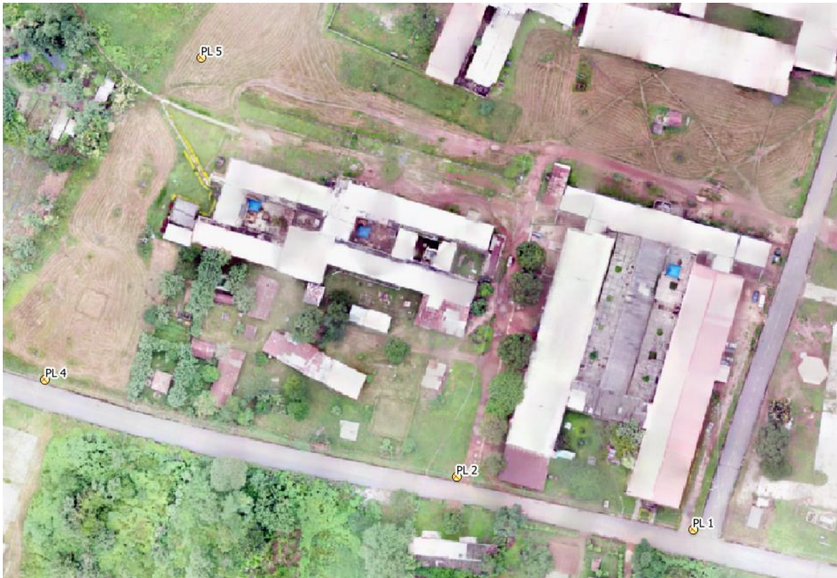
Figure 2.0 Sample Orthophoto showing comparison points for the Old School of Engineering Area