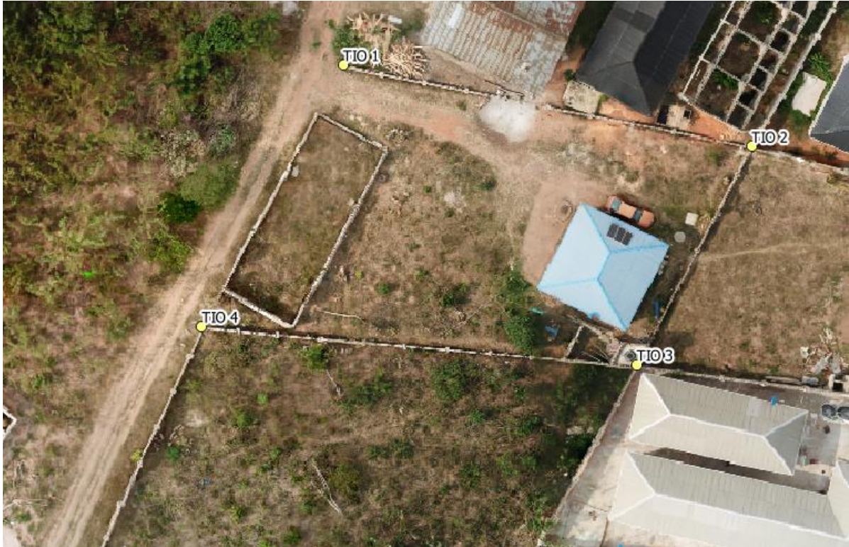
Figure 3.0: Sample Orthophoto Showing comparison points for Toluwani Bakery