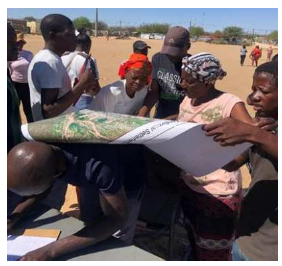
Figure 4: An aerial image of the informal settlements and community members locating their houses on the map in Ekunde 1