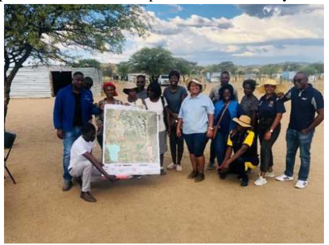
Figure 3: Community representatives, Okahandja Municipality, NUST, NHAG/SDFN officials

project by the municipal staff. They supported the data collection on the ground and availed resources, this has improved their relationship with the community.