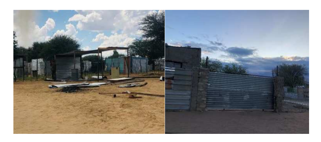
Overnight erection of new shacks and permanent structures

The existing layout plan for the settlements were drafted for greenfield areas before people occupied the settlement. However, the areas are now occupied by the informal communities, raising the need for updated layout plans that incorporates and recognised the existing structures. Planning done based on the existing layout plans will require communities to be relocated or evicted, which is a practice the project and community discourages.