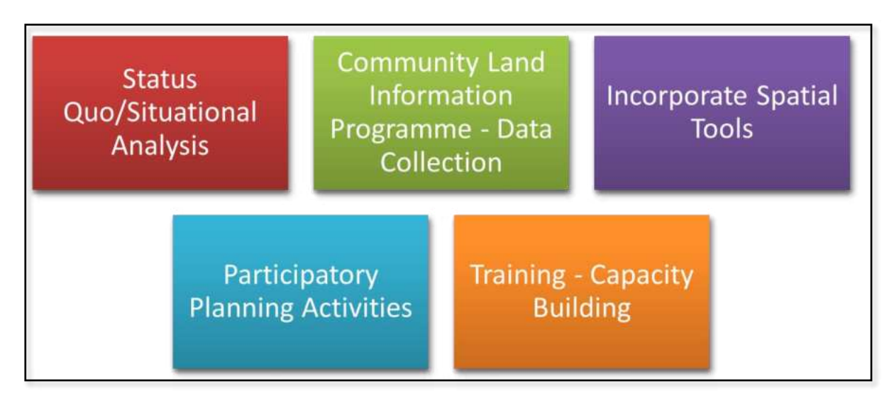
Figure 2: Framework for STDM in TR-LUP Initiatives