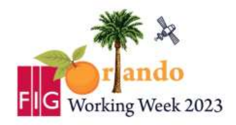
FIG WORKING WEEK 2023 28 May - 1 June 2023 Orlando Florida USA

Protecting Our World, Conquering New Frontiers