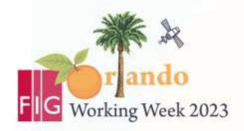
FIG WORKING WEEK 2023

28 May - 1 June 2023 Orlando Florida USA