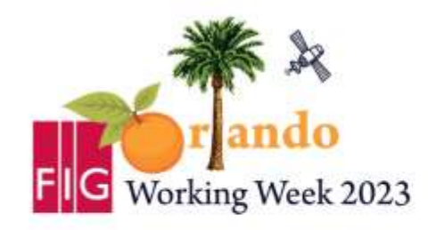
FIG WORKING WEEK 2023 28 May - 1 June 2023 Orlando Florida USA

Protecting Our World, Conquering New Frontiers