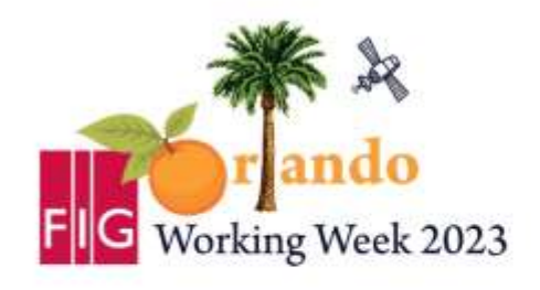
FIG WORKING WEEK 2023

28 May - 1 June 2023 Orlando Florida USA