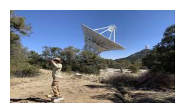
NGS siting new GNSS array at Kitt Peak National Observatory, AZ