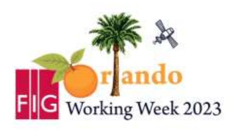
FIG WORKING WEEK 2023

28 May - 1 June 2023 Orlando Florida USA