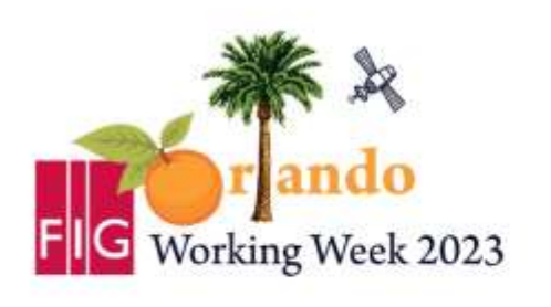
FIG WORKING WEEK 2023

28 May - 1 June 2023 Orlando Florida USA