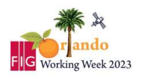
FIG WORKING WEEK 2023

28 May - 1 June 2023 Orlando Florida USA