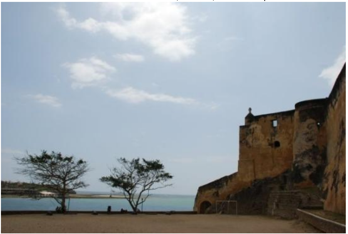
Fort Jesus, Mombasa Island; - Kenya National Museums and Heritage Act, 2006

The Climate Change Phenomenon has brought a different challenge from the one originally intended. The rising water level in the Indian Ocean, and the marine climate is eating away the bottom of the Portuguese Fortification and the National Museums of Kenya and by extension the Government of the Republic of Kenya will have to spend a fortune to protect the Fort Jesus. When I first joined the then Ministry of Works in 1980, there was a vote for Maintenance of the Sea walls in Mombasa, Malindi, Lamu. Is it possible this was scrapped?