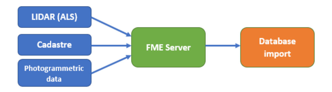
Fig. 3. Simplified LoD1 generation scheme.

to 3D by adding an appropriate height and shape to the roofs of individual buildings. The city model is based on LoD1 and LoD2 buildings, the update of which is dependent on the availability of current data. The process of generating LoD1 buildings runs automatically using the capabilities of the FME software. It is refreshed in weekly cycles triggered by the volatility of the urban cadastre.