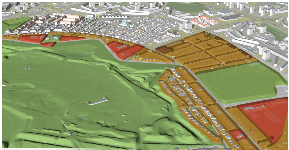
Fig. 5. Spatial planning – 3D model

The development of the 3D model and the Spatial Information System aims to support the city in implementing the Smart City concept. Buildings and other elements of the CityGML standard provide an ideal background for planning data. This combination leads to a better understanding of how the city is changing, its investment opportunities. The digital twin also offers the opportunity to present development concepts for new areas created by urban planning studios. Interaction with such a model facilitates the citizen–city debate.