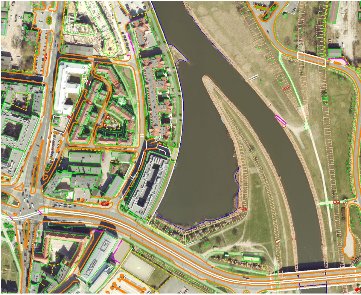
Fig. 1. Vector data acquired by stereodigitization of aerial photographs.

of photogrammetry were identified already in the 90s of the 20th century, when in ZGiKM GEOPOZ in the Department of Photogrammetry, works on the creation of the City Map of Poznań were initiated. It was launched in 1997 in vector form and was updated in biennial cycles through the use of photogrammetric techniques. The oldest aerial photographs in the possession of ZGiKM GEOPOZ were taken in 1989 in analogue form. The first fully digital aerial photographs for the entire city area were acquired in 2010, while in 2011 data was obtained by using a thermal camera. In 2021, photogrammetric works were carried out for the entire metropolitan area of Poznań. As a result of the photogrammetric flight, vertical and oblique images were taken and Airborne Laser Scanning (ALS) was realized. This data will be used to develop, among other things, a detailed mesh model and a true orthophoto. They constitute an invaluable source of information not only for the city of Poznań but also for the surrounding towns.