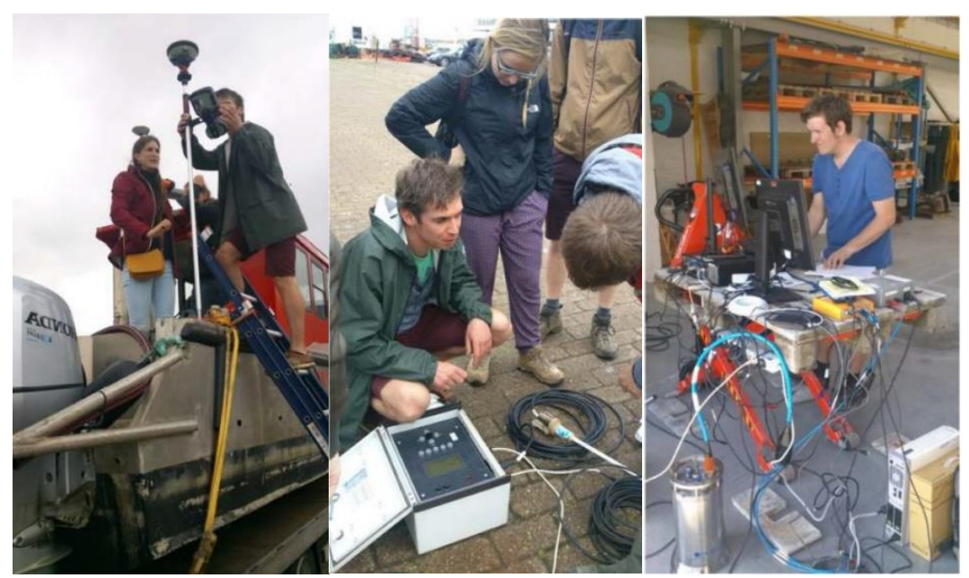
Figure 2. – Activities during the "Integrated Fieldwork" bathymetric week in the harbour of Ostend.