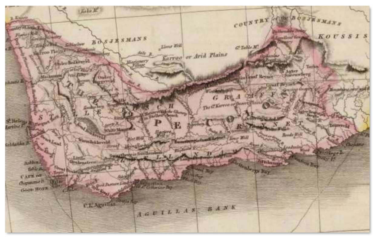
Cape Colony 1809, John Pinkerton, http://www.davidrumsey.com/maps4704.html

During the 18<sup>th</sup> century, there were widely distributed populations of other ethnic groups (mainly of Nguni origin) expanding into the areas previously occupied by the Khoikhoi herders and the San hunters and more recently by the trekboer newcomers (Braun, 2008, pp. 35 – 36). None of these were entirely sedentary, but enjoyed the vastness of the land where wild game could be hunted, settling only long enough for their cattle to benefit from the most fertile grazing lands. " Wealth flourished … allowing [clans] to prosper, specialise, interact, and transfer people, goods and knowledge " (Braun 2008, p. 35). The Nguni were a people whose " culture revolved around cattle . They were the people's most cherished possession … Socially they were a well-organised people, possessing a magnificently worked out system of law … of persons, and only in a minor degree a law of contract … A deep pietas reinforced by law protected age and station " (Brookes and Webb, 1965, p.2).