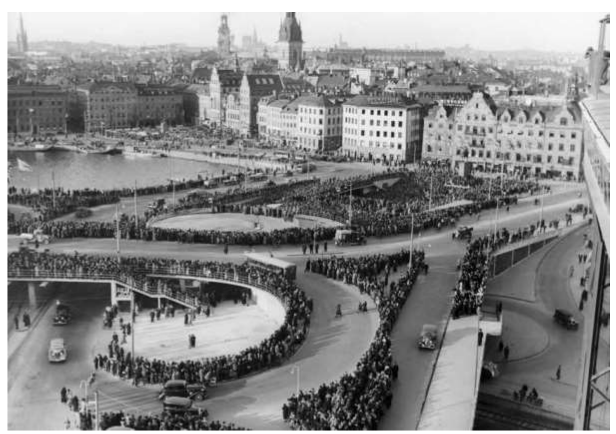
Opening in October 1935.