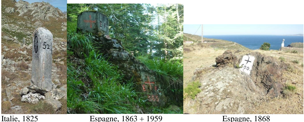
Espagne, 1863 + 1959

However, the national boundary survey has a specific process: the surveyor reads the text of delimitation treaty (and demarcation records, when available), he seeks for the boundary-pillars with the assistance of local authorities and he surveys these marks, most of them being identified on the printed map.