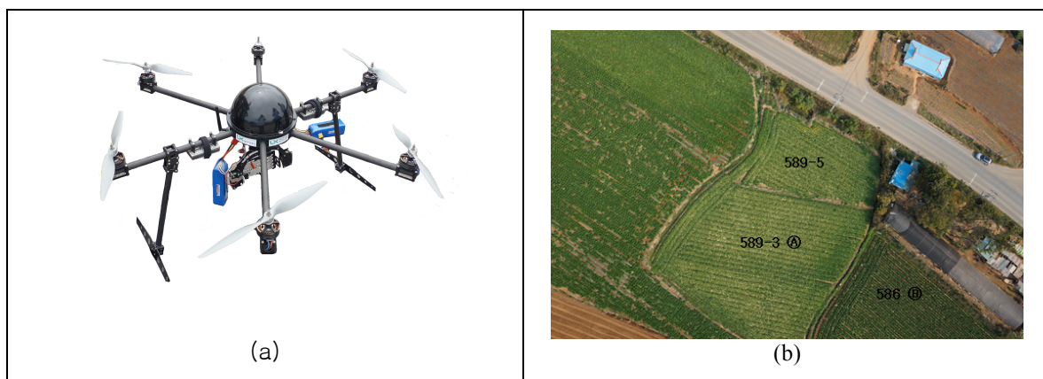
Figure 2: LX-UAV □ (Hexacopter)(a), and UAV digital image (b)

survey in the office instead of on the site.