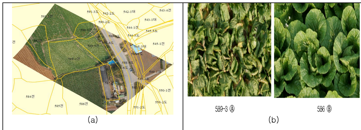
Figure 3: Screenshot of the digital image overlapped over the seamless cadastral map (a), and digital image for cabbage (b)