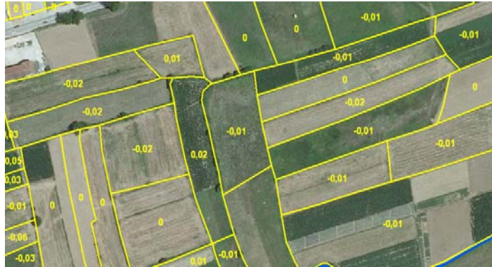
Figure 2. Orthophoto and cadastral data (yellow lines) base for land management and administration

Reconstruction of cadastral information is essential for systematic registration of cadastral information in cadastral model, as well as for cooperation with international donors' community. For operational cadastral model in general, relevant manuals and administrative instructions, within a legal framework, have been drafted, such as: