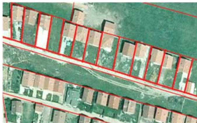
Figure 1. Cadastral documentation fully consistent with the ground situation (red lines).