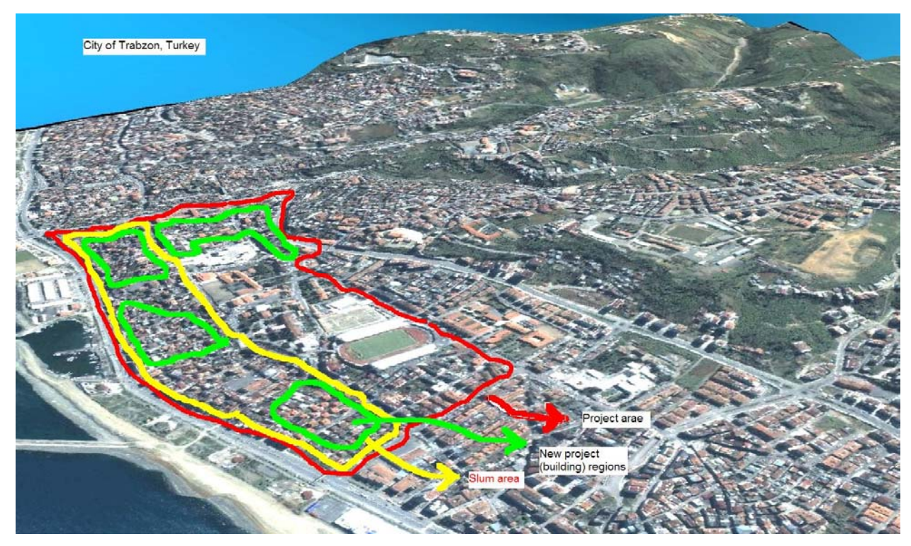
Figure.2 A View of Project Area (almost 600.000 m<sup>2</sup>)

In the planning area, a 30% of the total land is allocated for public areas such as roads, green areas and parks etc, while 15% of the total land is allocated as reserved land that will be sold to cover project operating expenses. And rest of the land will be given back to current land holders and slum landowners too. The main point here is that in the planned area extra new buildings with more number of flats should be available to give back to land owners. In land distribution process, rather than area distribution, a nominal value based distribution is applied.