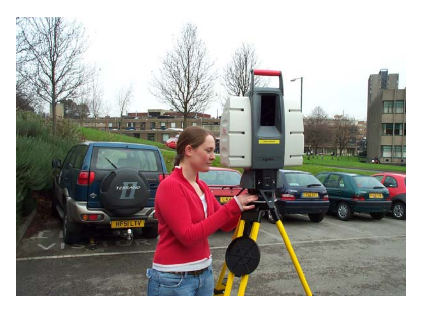
Figure 1: the Leica HDS3000 being set up at the University

A Leica Geosystems 3-D laser scanner, the Leica HDS3000 along with state of the art software package Cyclone 5.1, which gathers the data and can be analysed immediately after the scan. Leica Geosystems are a Swiss based company operating around the globe who specialise in the design and manufacture of laser scanners as well as other systems.