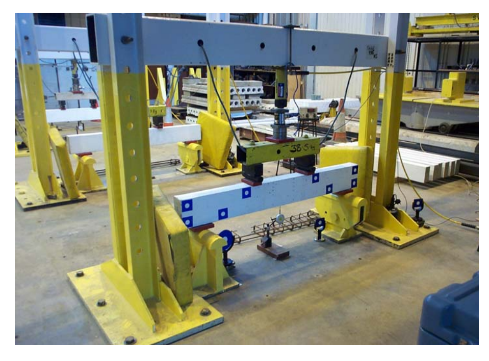
Figure 2: the concrete beam before loading with targets attached.

The total station is required as a truth for the comparison of results. This will be set up with a reflectorless target on the other side of the beam, which will be the reference line. Each point on the beam and the three independent HDS targets will be recorded. Coordinates will be given to the total stations and hence they can be calculated for each of the three points and the positions on the beam. The coordinates of the three independent targets can then be put into the Cyclone software and a coordinate system for the data is produced.