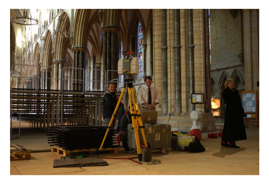
Figure 3: The laser scanner in action within Lincoln Cathedral.

The main issues that have arisen from these trials is the use of targets and how to tie in the points clouds using the registration facility within the Cyclone 5.1 software. As targets can not be placed on the cathedral walls, free standing targets must be used. This creates the problem of the public knocking them over and causing the scans to be invalid. Figure 3 illustrates a scan taking place at Lincoln Cathedral.