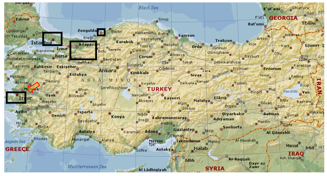
Figure 1: The regions where local geoid modeling studies were carried out in Turkey. The squares give an idea about the relative sizes of the coverage areas of the geoid models (Anonym 2001, Erol and Celik 2003). Izmir is pointed out with an arrow

Satellite Altimetry data, hydrographic measurements data and also using Digital Terrain models. However, the accuracy of TG99A is not the same for each part of the country (see Ayhan et al 2002). In some part of the area, this national regional geoid model can not satisfy the accuracy, which is necessary for most of the routine geodetic applications. There are some regions that the accuracy of the model is in meters (see Celik et al 2002). So, the necessity of studying on local geoid model appeared because of the national geoid model as a solution method. As it is well known, using more intensive and homogeneous distributed data and concerning the changes of geoid surface with in this limited area while modeling the geoid results increased accuracy of the model. With these aims, there are several local geoid modeling studies were carried out. The locations of these study areas are indicated on map (see figure 1).