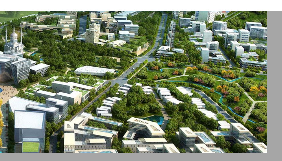
Sustainable urban development